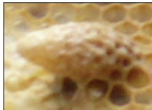
Yes! This beautiful sealed queen cell appeared